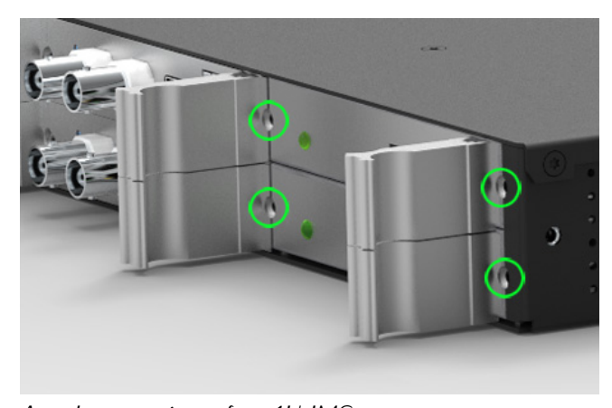
Attachment points of an 1U IMS system

4. Now you can put the installed module into operation.