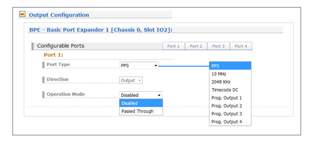
Figure: Web interface menu "IO Config o Output Configuration"

Via the web interface or the Meinberg Device Manager (MDU), the following signals can be distributed to the BNC connectors (TTL) or fiber optical connectors (ST) according to your choice: PPS, 10MHz, Time Code DCLS, 2048kHz and programmable pulse outputs PP 1 - PP 4 of the upstream reference source. With the programmable pulse outputs, each output channel of the pulse generator (IMS receiver) can now also be switched through to all available connectors of the BPE (for example PP 1 to Out 1 - Out 4 of the BPE).