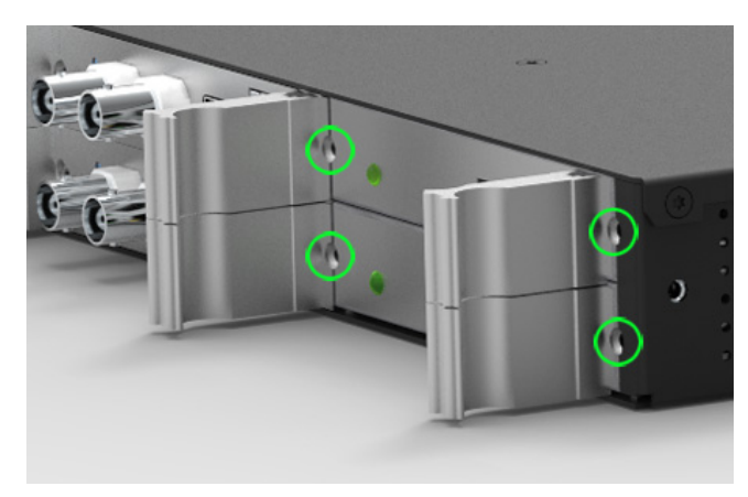
Attachment points of an 1U IMS system