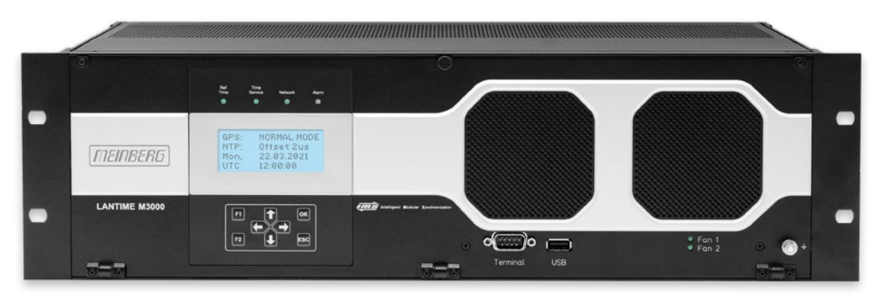
Front View IMS LANTIME M3000