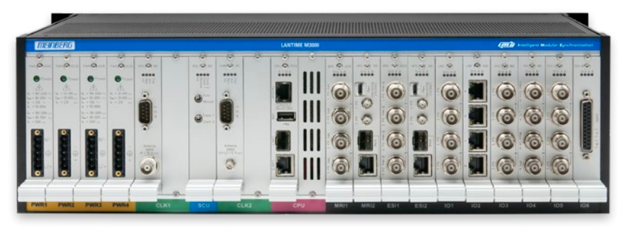
Rear View IMS LANTIME M3000 with sample configuration

The IMS LANTIME M3000 is also available as a headless variant in the form of the M3000S, which omits the display and control panel on the front of the device. The M3000S is intended for use in racks where only one side is readily accessible—in standard 19" racks or also 21" ETSI racks—and where there is no need for controls or displays on the device itself. Please note that the 3000S requires an external cooling solution such as Meinberg's Rack Cooling Unit (RCU).